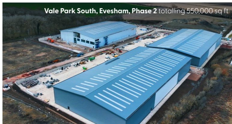
Vale Park South, Evesham, Phase 2 totalling 550,000 sq ft