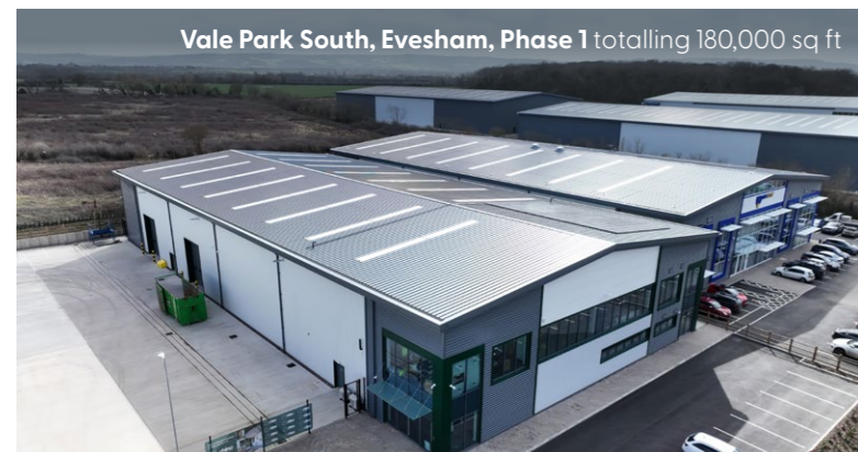
Vale Park South, Evesham, Phase 1 totalling 180,000 sq ft